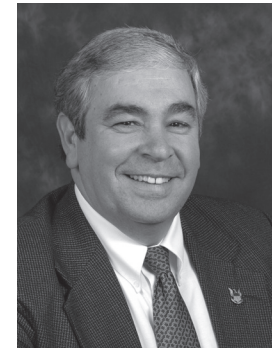
Mayor George Endicott